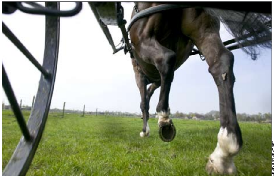
The highly specialized tissues of the synovial joint (such as the hock) come together to perform two main functions: Enable movement and transfer load from one bone to another.